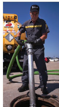
VACUUM TRUCK SERVICES