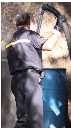
USED OIL/OIL FILTER COLLECTION

If your company is looking for efficient and environmentally responsible ways to handle cleaning and waste, call Safety-Kleen.